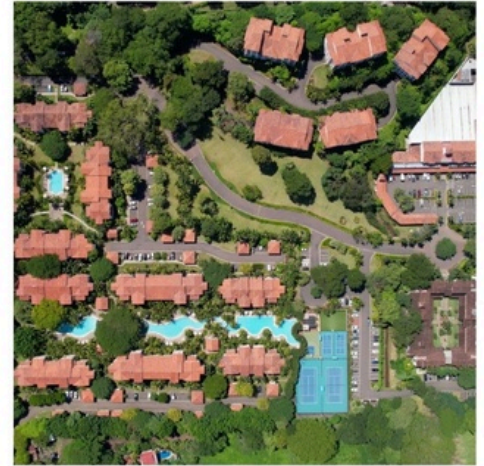
4 Pools & Sports Complex