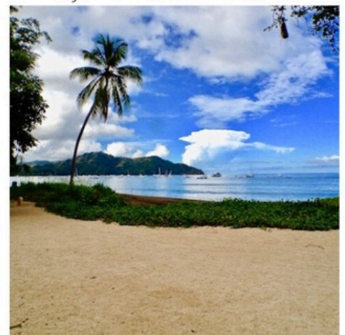
Free shuttle to Beach Club