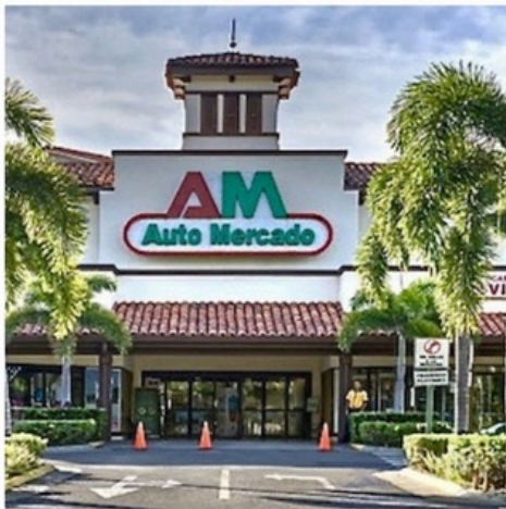
Supermarket & Retail Shops