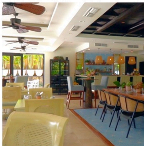
Dining room at Beach Club