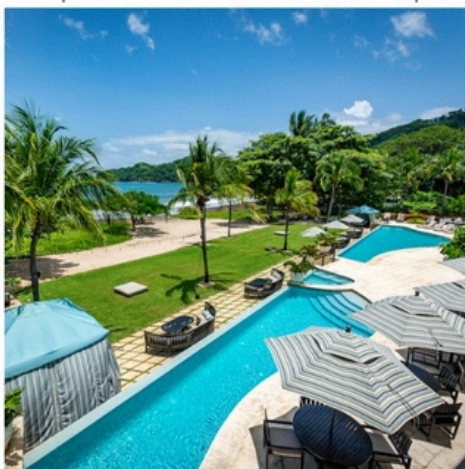
2 pools & private Cabanas