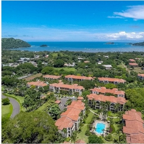
Walk to the beach!